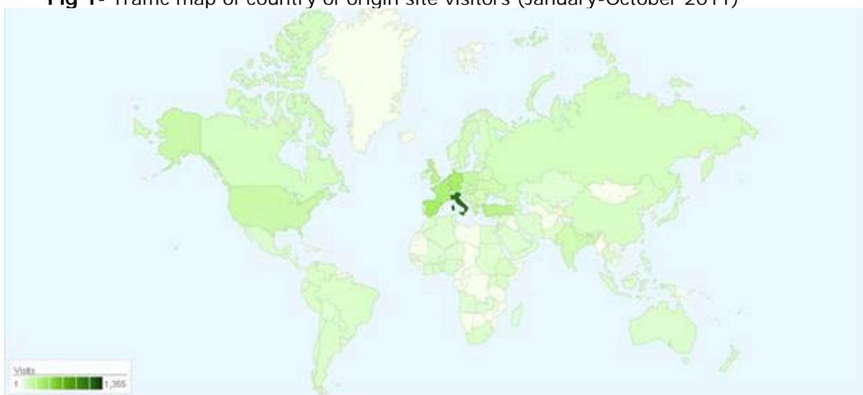
Fig 1- Traffic map of country of origin site visitors (January-October 2011)

6,737 visits came from 113 countries/territories